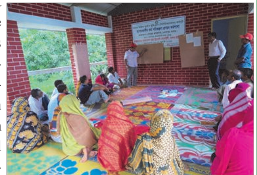
Figure: Contingency planning workshop at Shekhapura community, Jessore, Bhola

Contingency plans have been developed at the Shekhapura and Uttarsharsha community of Jessore and Satkhira district respectively. The plan outlines specific responsibilities and coordination mechanism among the local people, community leaders and sector specific actors through appropriate networking.