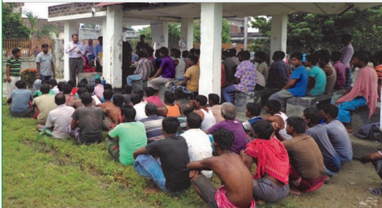
Hygiene Kits notification and collection of notification from Bagerhat Jail

During the reporting month, 499 Bangladeshi migrants returned home from Myanmar, Indonesia & Malaysia. Specifically, 6 Bangladeshi nationals came from Malaysia, 334 came from Indonesia by air and 159 came from Myanmar by land through Gundum check post in Cox'bazar. All are rescued from the Sea. The Department provided mobile services to 464 persons and first aid and medical services to 141 migrants. There were all together 78 minors. BDRCS reunited 68 minor migrants to their families in different districts through staffs and volunteers with the support of the ICRC and 10 minors reunited by associates.