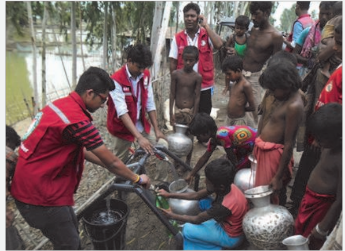
Treated water distribution in Cyclone KOMEN Response.

The Disaster Response Department provided support to Cyclone Komen Response Operation in South East districts. A total of BDT 9,000,000 Cash and 3,000 pieces Tarpaulin sheet were provided