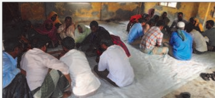
Figure 7: Involvement of Community PASSA Group members in proceeding Step One at the community

Different sessions of ToT was facilitated by expert PASSA facilitators from BDRCS and IFRC.