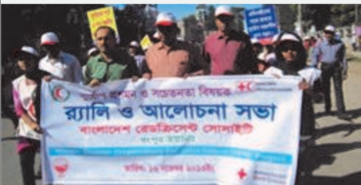
Figure 11: Rally on the day observation 'International Day of Risk Reduction' in Rangpur district

Training on Basic Disaster Risk Management was organized in November 2013. Total of 3 courses in Dhaka and 2 courses in Rangpur were completed with a view to raise awareness on disaster, implement disaster preparedness initiatives and develop knowledge regarding disaster management among school students. A total of 150 participants (including 135 students and 15 teachers) have received the training. However, the Programme couldn't able to organize 2 training courses because of having Eid vacation.