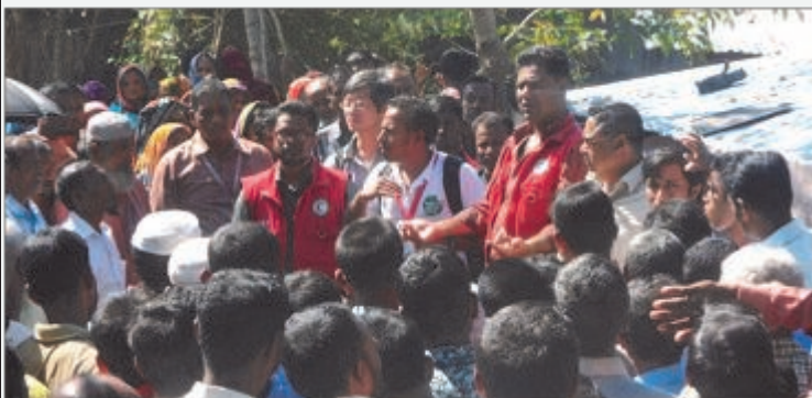
Figure 5: Beneficiary communication during Real Time Evaluation (RTE)

In November 2013, Cyclone Mahasen Early Recovery Project started its formal journey with Real Time Evaluation (RTE). The purpose of the RTE was to assess the on-going IFRC & Bangladesh Red Crescent Society (BDRCS) Tropical Cyclone Mahasen Emergency Appeal operation and make relevant recommendations to improve the implementation of follow up actions appropriate to the Bangladesh context. The review focused on several key aspects of relief phase and early recovery phase of the ongoing project. The evaluation was managed according to the IFRC Real-time Evaluation Management Guidelines (draft). An evaluation team composed of three people covering IFRC, BRC and BDRCS was involved in the whole process. After completing the process, evaluation team produced a comprehensive report.