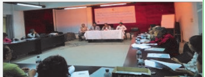
Figure 1: Secretary General and Directors of different Department of BDRCS participated in DRM strategy workshop organized at BDRCS Training Room.

A day long workshop on DRM Strategy was held with the facilitation of an external consultant at NHQ conference room, BDRCS. Issues which needs to be reviewed were identified and preparation for upcoming workshop were completed. All the DM stakeholders of BDRCS, and IFRC were involved in the process A total of 25 participants including Department Director, In charges, and Officers from BDRCS DM project/program, representatives from I FRC, Participating National Society (PNSs) attended and shared their views in the workshop. However, the challenge was to come up with all the relevant issues within a short period of time.