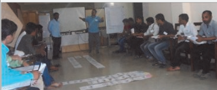
Figure 6: IFRC representative conducting session in PASSA ToT at Barguna district

Participatory Approach for Safe Shelter Awareness (PASSA) method was incorporated in the recovery project effectively. Under this initiative, 25 volunteers covering Barguna (# 10), Patuakhali (# 10), Gopalganj (# 3) and Rangpur (# 2) received ToT (Training of Trainer) on 24-26 November 2013 where they have learnt how to disseminate and facilitate 7 steps of the PASSA process in the community.