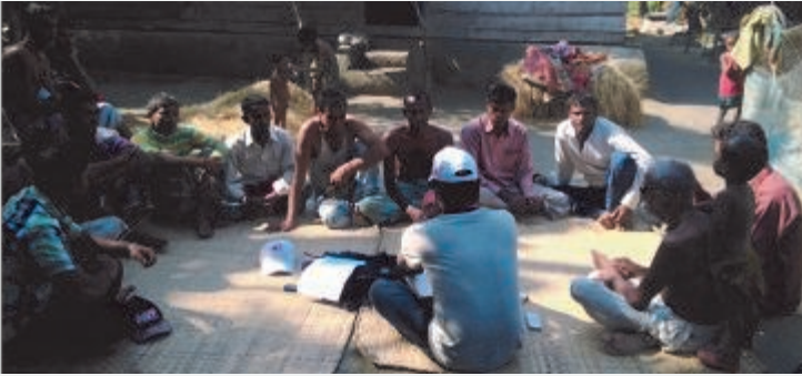
Figure 9: Survey Team member conducting FGD with the community people during baseline survey

The survey was conducted in both Patuakhali and Barguna district by the Unit volunteers. Just before that, the surveyors were oriented on baseline tool by the deployed Baseline Survey Team. A total of 2800 households were covered under the baseline survey in