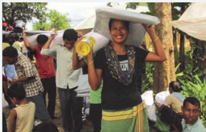
Figure 3: Distribution of relief to violence affected families

BDRCS joined a 2 days meeting with WFP (World Food Programme) on 9-11 November, 2013 in Cox's Bazar. Key objectives were to assess the performance of 2013 and develop an action plan for 2014 for Myanmar Refugee Relief Operation (MRRO) program. In the meeting WFP provided an excellent feedback on BDRCS interventions conducted under MRRO program in 2013.