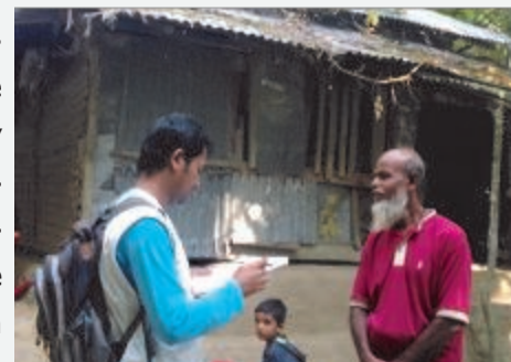
Figure 8: Surveyor conducting interview during baseline survey

Baseline survey for Mohasen Early Recovery Project was started, with considering feedback from RTE, just immediate after the RTE in November 2013. Project management had formulated and deployed a baseline team consisting 3 members from Response Department, PMER Section, BDRCS and DM Section, IFRC. For conducting the survey, a concise baseline survey tool was developed where feedbacks which have received from RTE Team were incorporated.