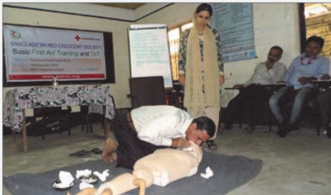
Figure 10: Participant of FA training practicing CPR

Training course on Search and Rescue was conducted with 18 employees of Holcim Cement company. Training of Trainers (ToT) on FA was organized with the staff of Flood Recovery Project in Kurigram district. A total of 10 officers and RCYs acquired knowledge on Basic First Aid and able to disseminate their learning to others.