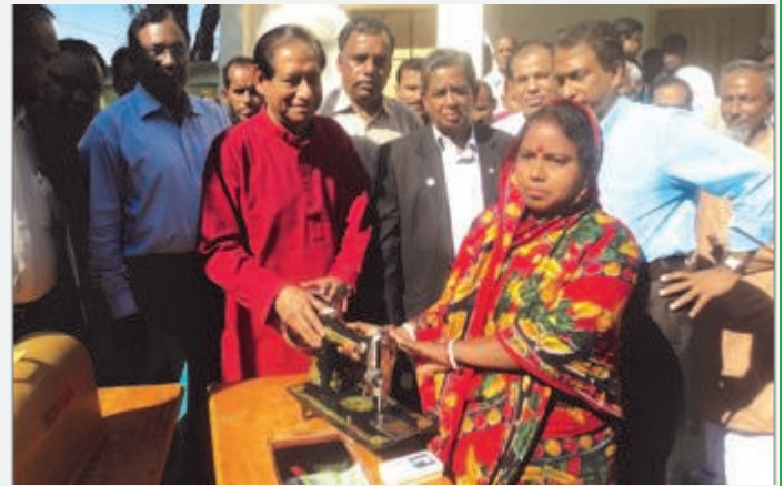
Figure 2: Distribution of swing machine to a women as a part of capacity building support at Rangpur district

Two community nurseries were established for providing quality seed to the farmers at Rangpur district. Aiming to capacity building of women in the area, trainings on Tailoring and Handicraft were conducted with 40 participants at Rangpur Unit.