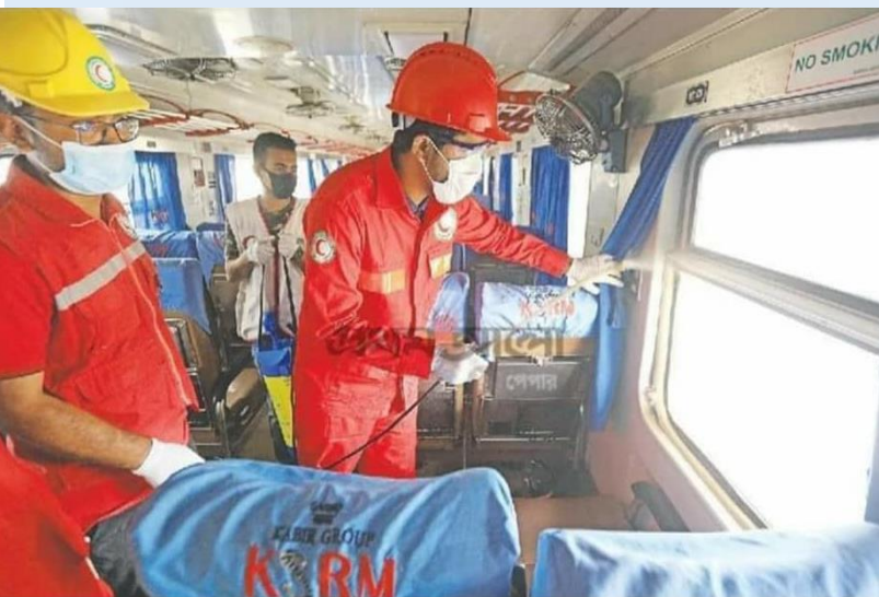
Photo 2: RCY volunteers carrying out disinfection activities at compartments of trains at Kamalapur Railway Station, Dhaka.