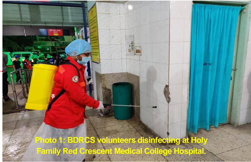
Photo 1: BDRCS volunteers disinfecting at Holy Family Red Crescent Medical College Hospital.