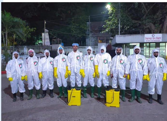
Photo 4: RCY volunteer team ready to carry out disinfection spraying at public transports and hospitals.