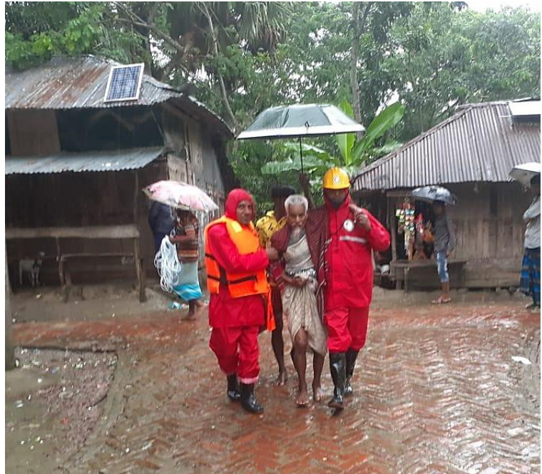
Photo1: BDRCS volunteers supporting evacuation in Bagerhat