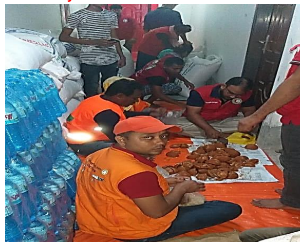
Photo #4: RCY and CPP volunteers closely working for dry food packaging in Patuakhali..