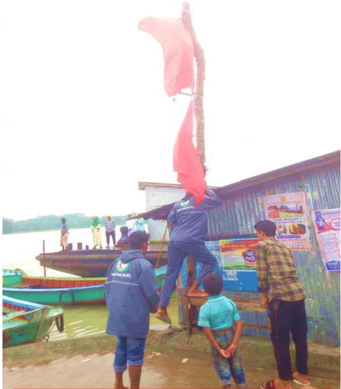
Photo #9: RCY volunteers setting cyclone signal flags in Jhalakathi district.