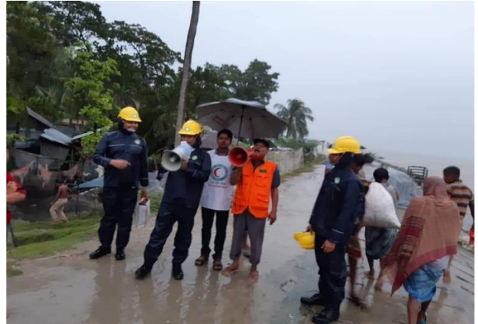
Photo #8: Unit team with CPP in Laxmipur announcing evacuation info.