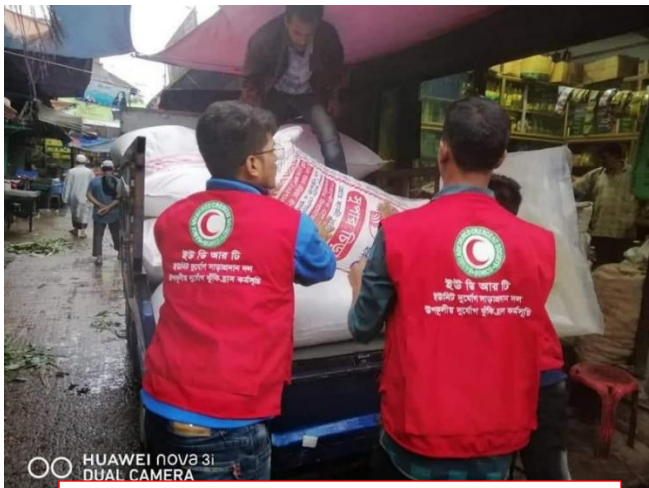
Photo #5: UDRT volunteers loading dry food packets to ship to shelters in Bagerhat.