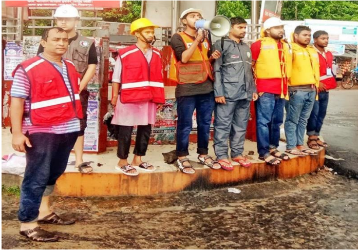
Photo #7: RCY volunteers providing evacuation message in Pirojpur district.