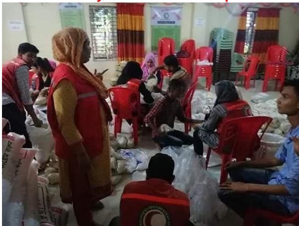
Photo #3: Laxmipur Unit RCY volunteers preparing dry food packets to distribute in shelters.