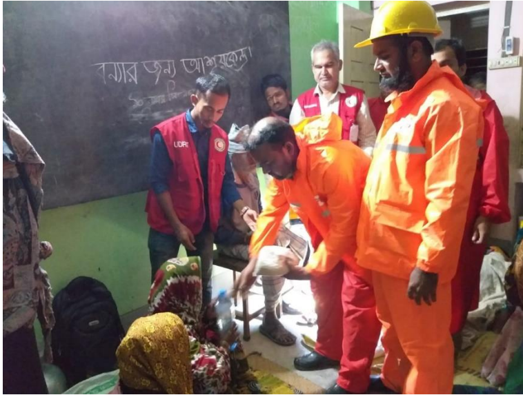
Photo #2: Patuakhali Unit RCY volunteers and CPP volunteers providing dry food packets among sheltered people.

distributed a total number of 11450 packets of dry food (flattened rice/ sugar/ puffed rice/ biscuit/ water) among people who resided overnight in the shelter centers.