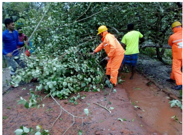
Photo #1: CPP volunteers removing road blockage at Chila Union of Mongla Upazila under Bagerhat district.