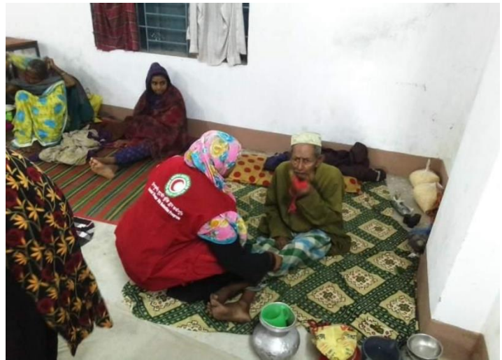
Photo #10: RCY volunteer provided support to the elderly and other people with special need who resided overnight in shelter centers.