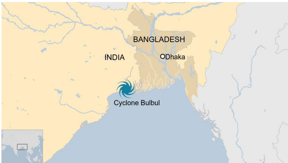
Map1: Cyclone BULBUL's landfall location near West Bengal Sundarban and Khulna region.

The Very Severe Cyclone Bulbul gradually weakened and turned into severe cyclonic storm and afterwards deep depression followed deliberate landfall in the coastal belt alongside the Bay of Bengal. According to Bangladesh Meteorological Department (BMD), Maritime Ports of Mongla, Payra, Chattogram and Cox's Bazar have been advised to lower to hoist Local Cautionary Signal Number Three (Riverine) from previously suggested ones. Relentless rainfall ranging from low to high, fueled the process of reducing wind speed in the districts anticipated to be affected most ( source: BMD special weather bulletin no 30 of 10 November 2019 ). However, wind may flow at 50-60KPH speed in the coastal districts in a northeastward direction.